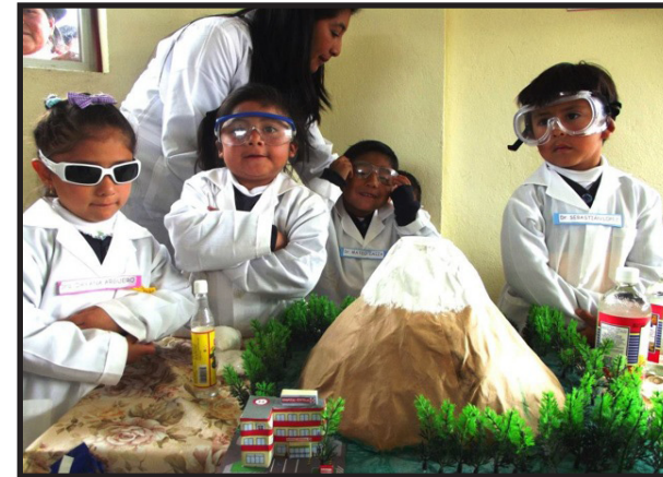
Performing a science experiment